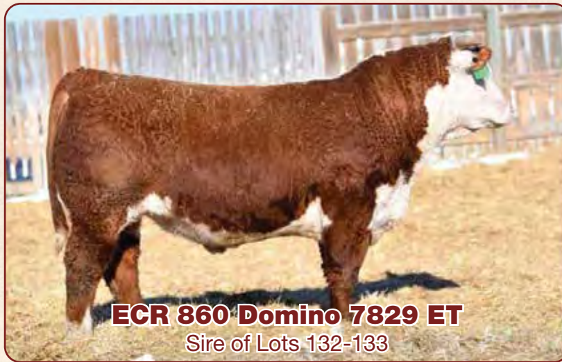
ECR 860 Domino 7829 ET Sire of Lots 132-133

A long-sided, goggle-eyed, bull with a deep dark hide who is a grandson of the great maternal CL 1 Domino 860U combined with the performance sire HH Advance 4140P who stems from a powerful cow family, with great carcass and muscle. This bull also goes back the foundation female RJ's Ruby 4025 who has been around for 18 years and is the cornerstone of most of RJ's cowherd. Longevity and maternal strength with soundness are the traits of this bull's pedigree.