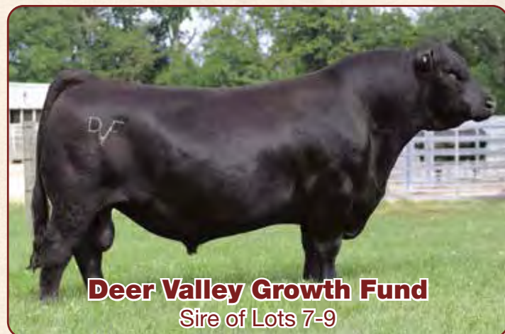
Deer Valley Growth Fund Sire of Lots 7-9

Another son of the highly sought-after Deer Valley Growth Fund with EPDs that place him in the top 2% among non-parent Angus bulls for RADG EPD, Angle EPD, and $Feedlot Value, top 3% for YW EPD, $Wean Value, and $Combined Value, top 4% for CW EPD, top 5% for WW EPD, top 10% for CEM EPD and $Beef Value, top 15% for Milk EPD and $Maternal Weaned Calf Value, and top 20% for CED EPD and Doc EPD.