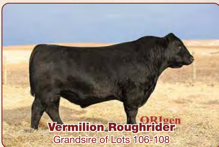
Vermilion Roughrider Grand sire of Lots 106-108

A moderate birth weight grandson of Vermilion Roughrider and out of a Pathfinder dam stemming from the great Forever Lady cow family. EPD's rank this bull in the top 15% among non-parent Angus bulls for Fat EPD, top 20% for BW EPD, Milk EPD, $Maternal Weaned Calf Value and $Wean Value, top 25% for $Energy Value, and top 30% for CED EPD. A maternal brother sold in the 2021 Sale to the 33 Ranch of Backus, Minnesota.