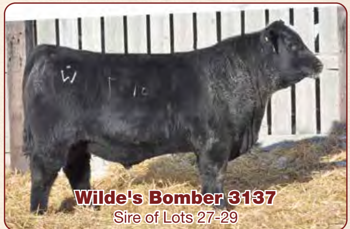
Wilde's Bomber 3137 Sire of Lots 27-29

A powerful son of Wilde's Bomber 3137 who comes from a long line of great Angus females including Sitz Everelda Entense 1137 and Baldrige Everelda 533. The maternal granddam is a great producing Pathfinder dam who consistently produces the cream of the crop. EPDs ranks in the top 2% among non-parent Angus bulls for his WW EPD, YW EPD, SC EPD, CW EPD, and $Feedlot Value, top 10% for HP EPD and $Beef Value, top 15% for $Combined Value, top 20% for RADG EPD, and top 25% for Doc EPD and $Wean Value. Tremendous growth with great maternal strength!