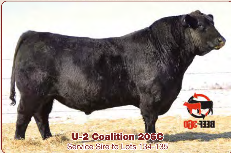
U-2 Coalition 206C Service Sire to Lots 134-135