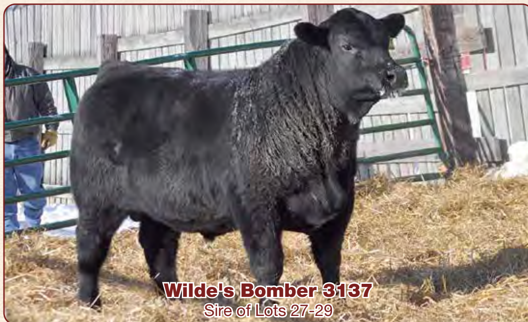
Wilde's Bomber 3137 Sire of Lots 27-29

A son of the previous feature Lot 28 in the 2020 Sale and out of a first calf heifer that has the genetics be an outstanding female stemming from two consecutive Pathfinder dams. EPDs place this bull in the top 4% among non-parent Angus bulls for his SC EPD, top 10% for WW EPD and $Wean Value, top 15% for CW EPD and RE EPD, top 20% for $Feedlot Value, top 25% for YW EPD and top 30% for Milk EPD.