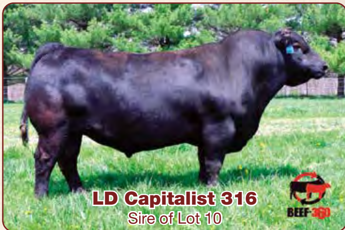
LD Capitalist 316 Sire of Lot 10