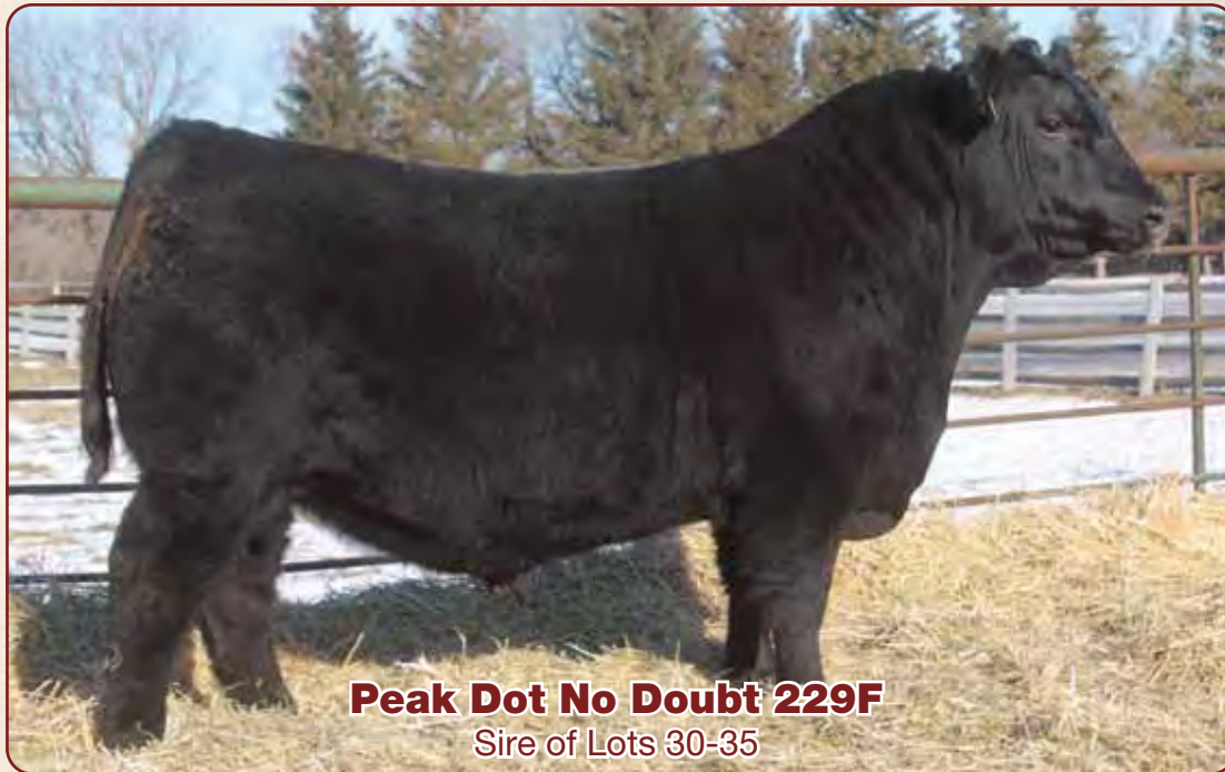
Peak Dot No Doubt 229F Sire of Lots 30-35