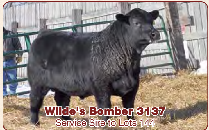
Wilde's Bomber 3137 Service Sire to Lots 144

Breeding Info: Due March 16, 2022 to Musgrave Stunner.